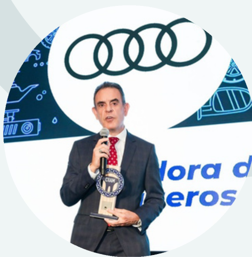
Light Vehicle Manufacturer of the Year: Audi