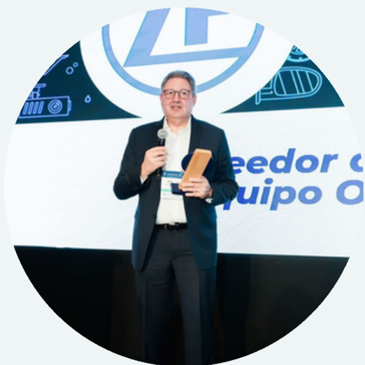
Tier 1 Original Equipment Supplier of the Year: ZF Group