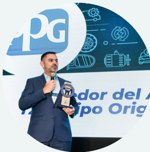
Aftermarket Supplier of the Year: PPG